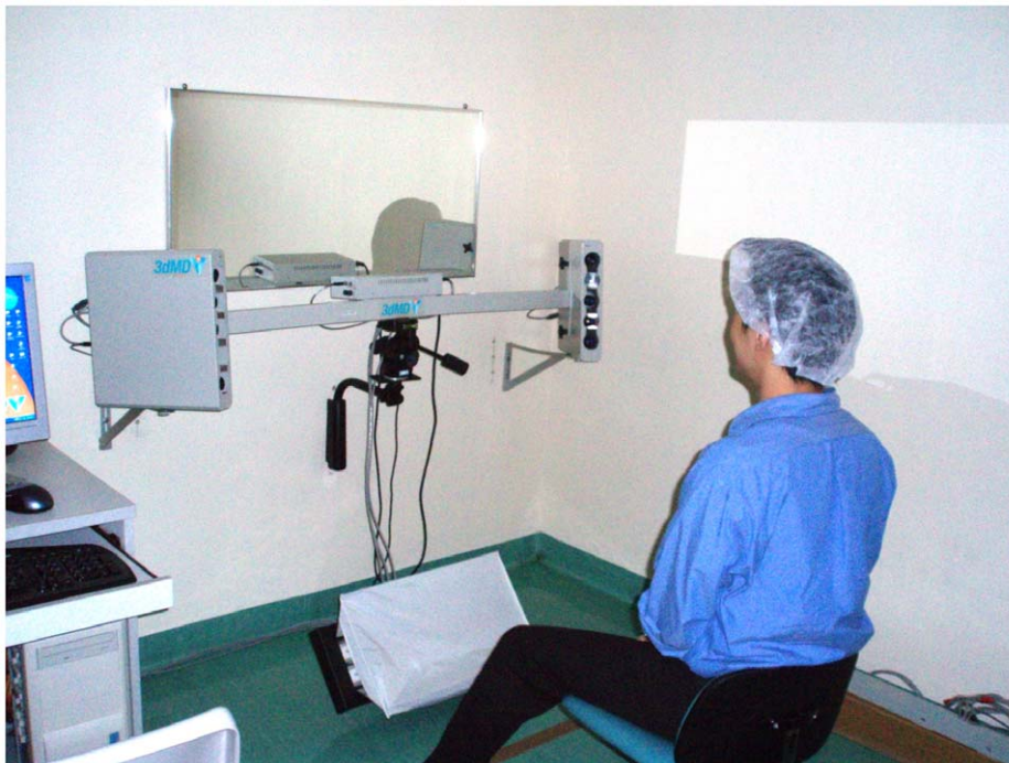
Figure 2. The stereophotographic system used for acquiring 3-D images.

An a priori decision was made that a facial canon would be considered valid if the difference between the values predicted by the equations in Table 1 and the actual measurement was below