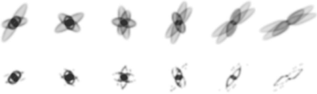
Figure 1. Perception of morphology is affected by viewing angle and sensitivity. Upper row: With the six angles in the model fixed, the viewing angle is changed from each image to the next by 15^\circ of i and 15^\circ of PA. Lower row: Each image is modified from the one above that the faintest pixels below one-third of the peak brightness are cut off. Brightness levels are shown in linear scale.