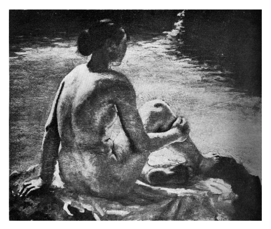
Figure 3. Hu Yiwen, Hepan nu (Woman by the Riverside) (from Yi Feng, May 1935, 3 [5]: 138)

making a freehand copy ( lin ) or self-consciously producing a work in a particular master's style ( fanggu ).<sup>17</sup>