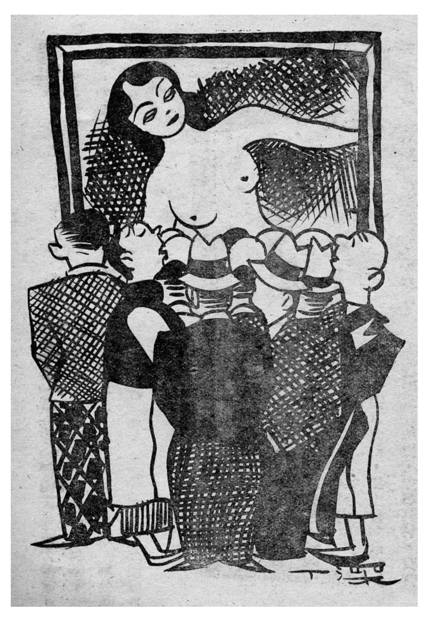
Figure 4. A cartoon concerning the audience for paintings of the nude (from Yi Feng, Shanghai, May 1, 1935, 3 [5]: 75)