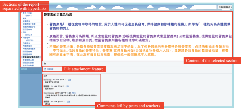
Figure 3. Sample of students' GS project work on Google Sites (with annotations in red)

While members of the same group could revise the group project virtually any-time, they could also review earlier versions made by their peers. Besides co-construction of group work, the students could also utilize the platform for communication and negotiation purposes through wiki's commenting feature. The teachers, who had access to students' online platforms, were able to continuously monitor students' work output and provide evaluative feedback when necessary.