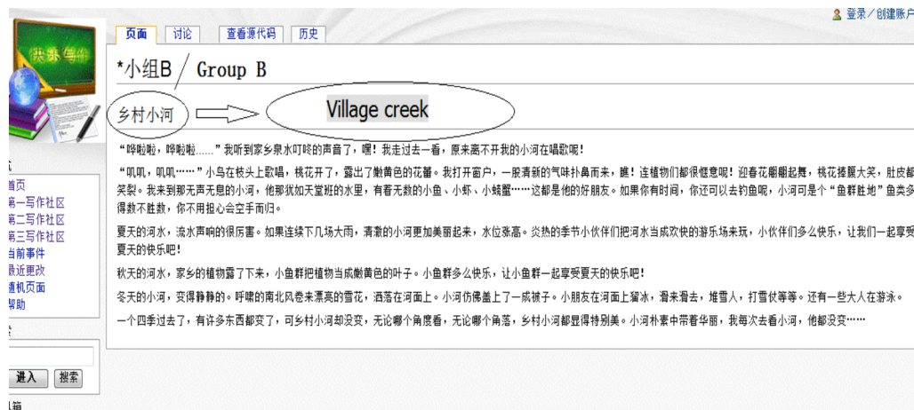
Figure 3: Wiki page by Group B

teacher asked students to talk about the materials they had collected for the writing, including pictures and related articles, and the materials would be shared among classmates. Afterwards, the teacher guided students to think about how to write their own compositions, and to do some brainstorming with their group mates.