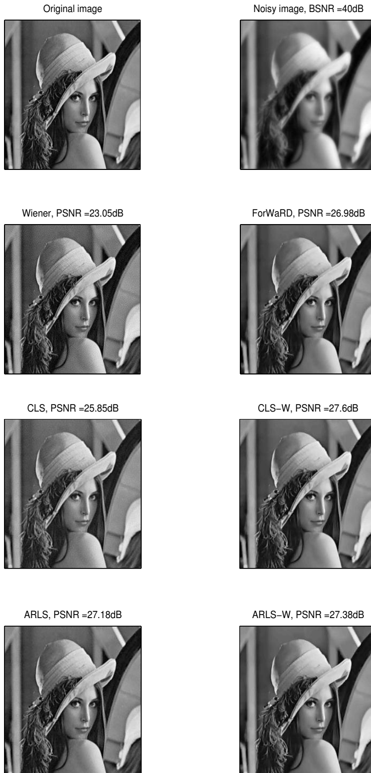
Figure 2. The Original image, the blurred and noisy image, the restored image using the Wiener filter, the ForWaRD with \alpha = 6.71 \times 10^{-3} , using the CLS with \alpha = 9.31 \times 10^{-3} , the CLS-W with \alpha = 1.86 \times 10^{-5} , the ARLS \alpha = 1.24 \times 10^{-2} and the ARLS-W \alpha = 1.24 \times 10^{-2} .