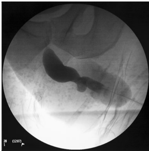
Fig. 6 The antegrade cystogram showed relative narrowing of the bulbar urethra. There was no contrast leakage

The management of an urethrocutaneous fistula in the setting of denuded penis is not well documented in the