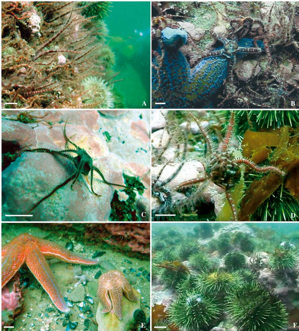
Fig. 3. Echinoderms spawning in 2003 off the Mingan Islands, eastern Canada. (A) Non-spawning ophiuroids Ophiopholis aculeata , with the central discs tucked into pits in a calcareous rock wall and arms extended to feed. (B) Male ophiuroid O. aculeata that has crawled onto its predator, the sea star Asterias vulgaris , to spawn. (C) Pseudocopulation of 2 ophiuroids Ophiura robusta , with the central discs held oral-to-aboral surface, and (D) pseudocopulating by 3 ophiuroids O. aculeata , central discs held together. (E) A sea star, A. vulgaris (left), that is moving rapidly towards another sea star (right) in spawning position. (F) Spawning female sea urchin Strongylocentrotus droebachiensis (behind) that is moving closer to a spawning male (front left). Scale bars = 1 cm.