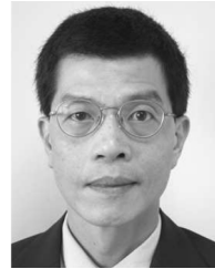
computer vision, and biomedical engineering.