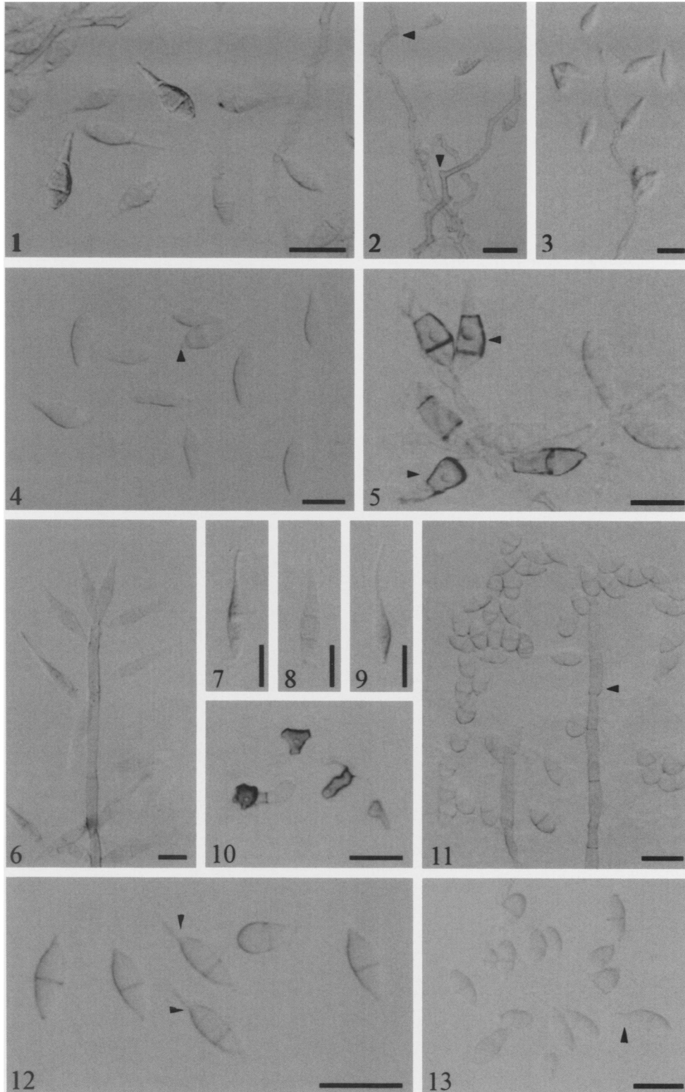
FIGS. 1–13. Pyricularia costina , P. kookicola , P. longispora and P. variabilis . 1, 2. P. costina . 1. Conidia. 2. Conidiophores with denticles (arrowed) and conidia. 3–5. P. kookicola (from holotype). 3. Conidiophore and conidia. 4. Conidia with protuberant hilum (arrowed). 5. Matured conidia (arrowed). 6–10. P. longispora (from holotype). 6. Conidiophore and conidia. 7–9. Conidia. 10. Irregular shaped hyphopodia. 11–13. P. variabilis (from holotype). 11. Conidiophores with swollen intercalary nodes (arrowed) and conidia. 12, 13. One and two (arrowed) septate conidia. Scale bars = 20 \mu m.