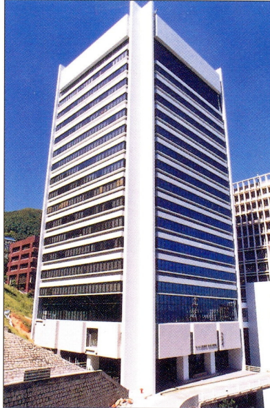
The Leung Kau Kui Building present home of the Faculty of Law