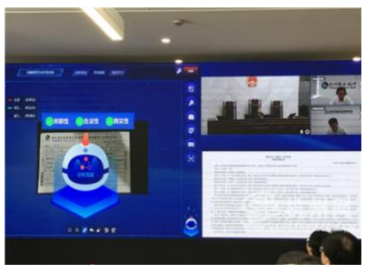
"Xiao Zhi" assisting adjudication in a Hangzhou court

especially in controversial and complex cases.<sup>60</sup>