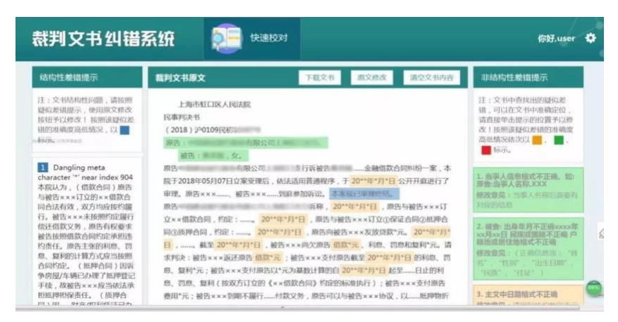
Abnormal judgment warnings system deployed by a Shanghai court

anomalies in judicial outcomes. <sup>72</sup> When adapted for this purpose, the machine draws supervisory attention to decisions that lie outside the bounds set by past cases. "Abnormal judgment warnings" are principally issued in the field of criminal law to police the disparity between sentences. <sup>73</sup>