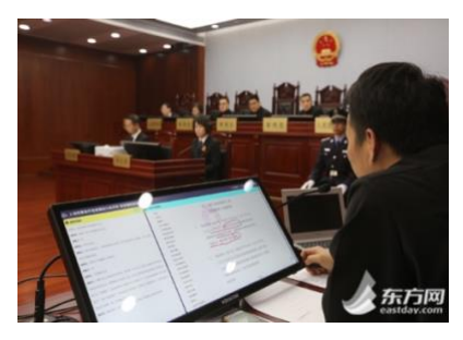
A prosecutor referring to evidence using the Shanghai's 206 system

Artificial intelligence does not merely conserve judicial time and resources. It may also improve the consistency and quality of adjudication with its accurate recommendation of related laws and similar cases and automatic generation and