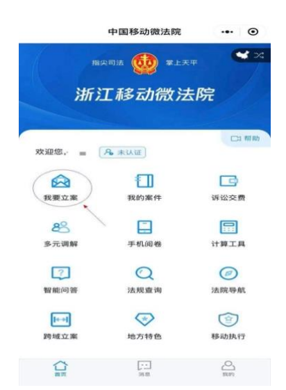
SPC Online Portal for Litigation Services