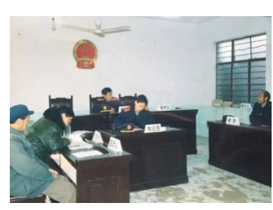
A Beijing Court in the 1990s

digital platforms that also allow them to inquire about the status of their litigation. When the matter goes to trial, evidence is automatically presented on the oral request of the judge or the participants. <sup>6</sup> The same artificial intelligence system is also capable of sieving out unreliable evidence and detecting contradictions between statements. <sup>7</sup> As the dispute nears a resolution, computers generate draft opinions that relate its background and procedural history. Algorithms for identifying similar fact patterns raise the alarm if a judge's decision veers too far from the norm. And the opinions and outcomes of cases are published on the internet for all to see.