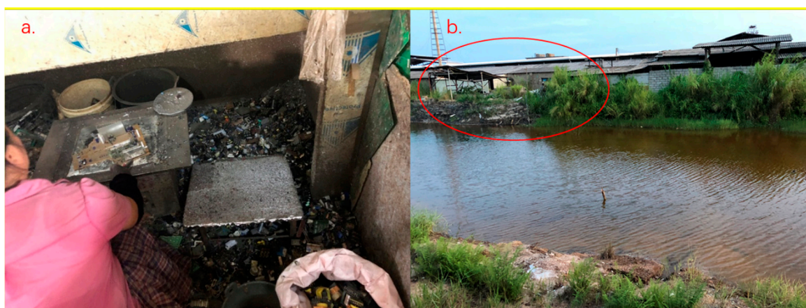
Figure 2. Workshops of circuit board baking and precious metal extraction in Guiyu.

Guiyu has drawn widely scholarly attention of environmental and health specialists, whose research has provided scientific evidence of the environmental and health problems associated with informal e-waste recycling. Excessive concentrations of heavy metals and toxic chemicals have been detected in the soil, water, and air at Guiyu [4]. The Lianjiang River and Nanyang River in Guiyu, as a result of strong acid leaching (gold washing, as mentioned above) were respectively enriched with dissolved As, Cr, Li, Mo, Sb and Se, Ag, Be, Cd, Co, Cu, Ni, Pb and Zn [28]. Some scholars have studied the exposure levels of PCBs for local residents and e-waste workers in Guiyu, based on