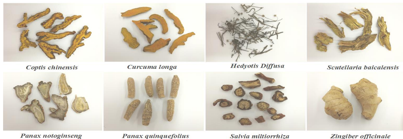
Figure 2: Images of the medicinal parts of the Chinese herbal medicine used for both medicinal and food purposes.

Clinically, H. diffusa has been used as a main component in some Chinese medicine formulas for CRC treatment. Ethanol extracts of H. diffusa have been shown to inhibit the proliferation of 5-FU resistant HCT-8 cells via downregulation of the expression of p-glycoprotein and ATP-binding cassette subfamily G member 2, and to inhibit proliferation and induce apoptosis in HT-29 cells through inactivation of IL-6-inducible Stat3 pathway [16, 17]. Furthermore, the n-butanol fraction of P. notoginseng has been shown to inhibit proliferation and induce apoptosis in SW-480 cells, while potentiates the cytotoxic effects of 5-FU against HCT-116 cells [18, 19]. Interestingly, panaxadiol from P. notoginseng potentiated the cytotoxic effects of 5-FU against HCT-116 cells [20]. Moreover, ginsenoside Rg3 from P. quinquefolius or P. ginseng inhibited SW-480 cell migration via inhibition of NF-κB, and