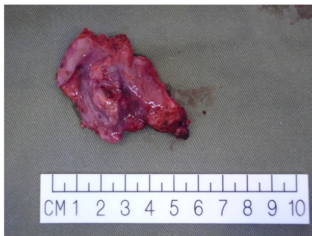
Figure 5 Photo of the radical tonsillectomy specimen.

radiotherapy and the addition of chemotherapy were shown to be a predictor of poor swallowing outcome. 34,36,37 As the survival of HPV-related oropharyngeal cancer is excellent, minimizing the long-term complications after treatment is necessary.