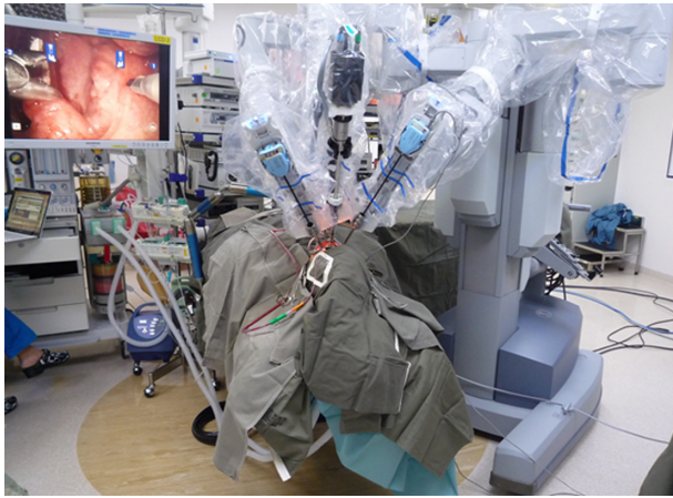
Figure 1 View of the setup of the patient and the da Vinci surgical robot for robotic radical tonsillectomy.

adjacent tissue damage, and excellent tissue hemostasis. 19–22 The EndoWrist® and angled telescope of the da Vinci surgical robot allow delivery of laser to areas previously not able to be reached by traditional delivery methods like transoral laser microscopic surgery.