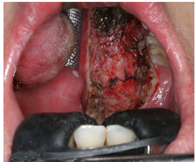
Figure 4 Immediate postoperative view of the surgical defect after robotic radial tonsillectomy.

In the West, oropharyngeal cancer became the dominant type of cancer in the upper aerodigestive tract from the year 2000. 32 The majority of the oropharyngeal cancers harbor the human papilloma virus (HPV). 33 Ang et al showed that HPV-related oropharyngeal cancer had a markedly improved survival after definitive treatment with chemoradiotherapy, and HPV was shown to be a strong and independent prognostic factor in oropharyngeal cancer. 34 The 3-year overall survival of the HPV-positive oropharyngeal cancer patients in Ang's cohort was 82.4%, compared to 57.1% in the HPV-negative patients. Primary chemoradiotherapy was shown to affect the swallowing function of the patients to an extent that the patient could become feeding-tube dependent. 33,35,36 Higher dose of