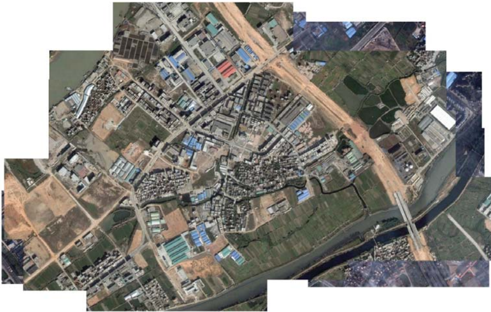
FIGURE 7: The contested Danwei site and new highway.

opposite: “Say whatever they want! At the end of the day, it is rural land and it belongs to the collective” (Liu Zufa, in discussion with the author, June 2011).