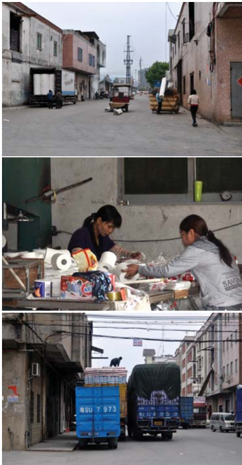
FIGURE 6A, 6B, 6C: The distributed factory of toilet roll production.

In contrast to this rapid industrialization, one plot amidst the frenzied construction is devoid of activity, containing a series of empty and incomplete three-story brick houses, interspersed with patches of vegetable crops and wasteland. Its current sta-