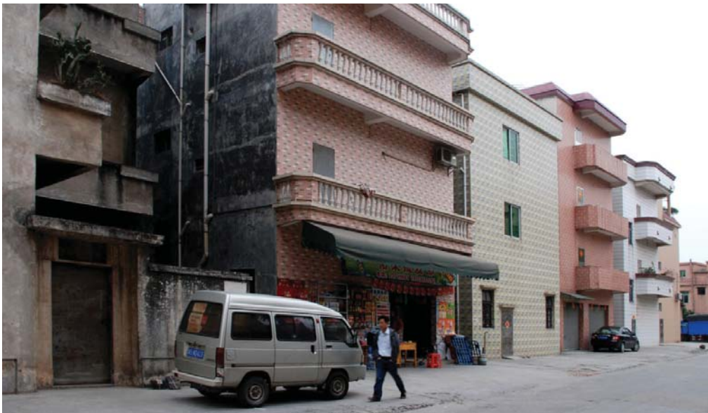
FIGURE 5: The adaptation of the shop-house. Image credit: Joshua Bolchover