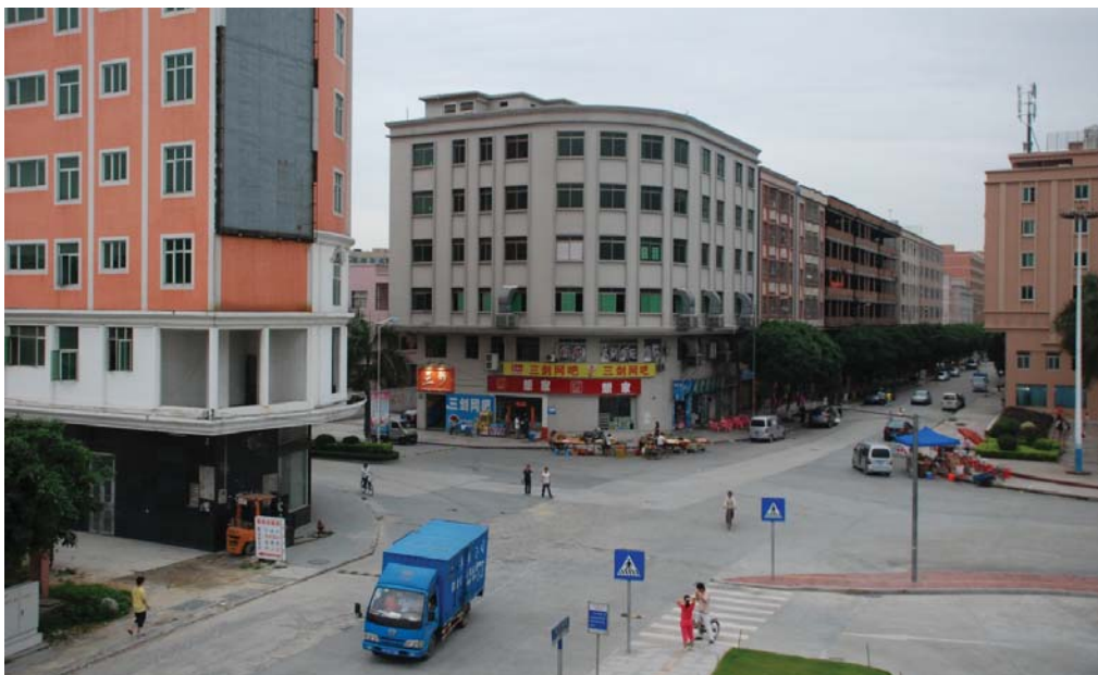
FIGURE 9: Model of new residential development: a business venture between the village cooperative and a private developer.

The creation of the shequ enables such development to occur more easily, as it facilitates the acquisition of larger land plots. As a result, in just thirty years, farmland has