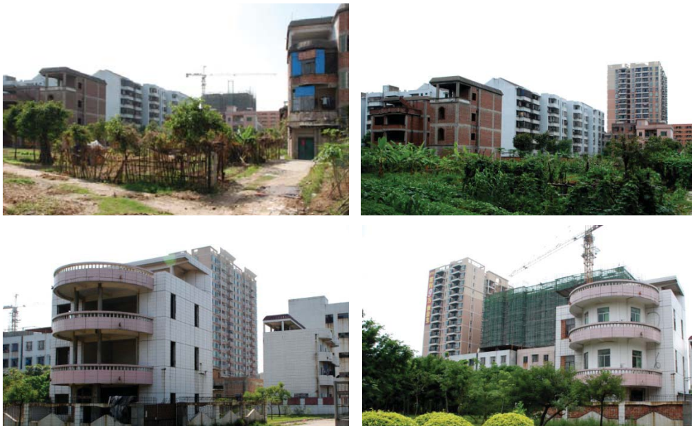
FIGURE 2: Jian Sha Zhou in 2008 (left) and in 2011 (right).

part of rural urbanization and its associated political context. Rather than analyze land market policy (Ho and Lin 2003), property rights, or the precise legal frameworks of Chinese land development (Ho 2001), we focus on the spatial implications of the urban transformation. As a mini-scenario (Bunschoten, Binet, and Hoshino 2001), this case study highlights the forces (and their possible effects) that may have an impact on future urban development. Because of changes in land policy over the last thirty years, China is witnessing increased contestation over land ownership, compensation, and use. In the majority of cases, the contestation is a result of the difference in status between rural and urban land. This