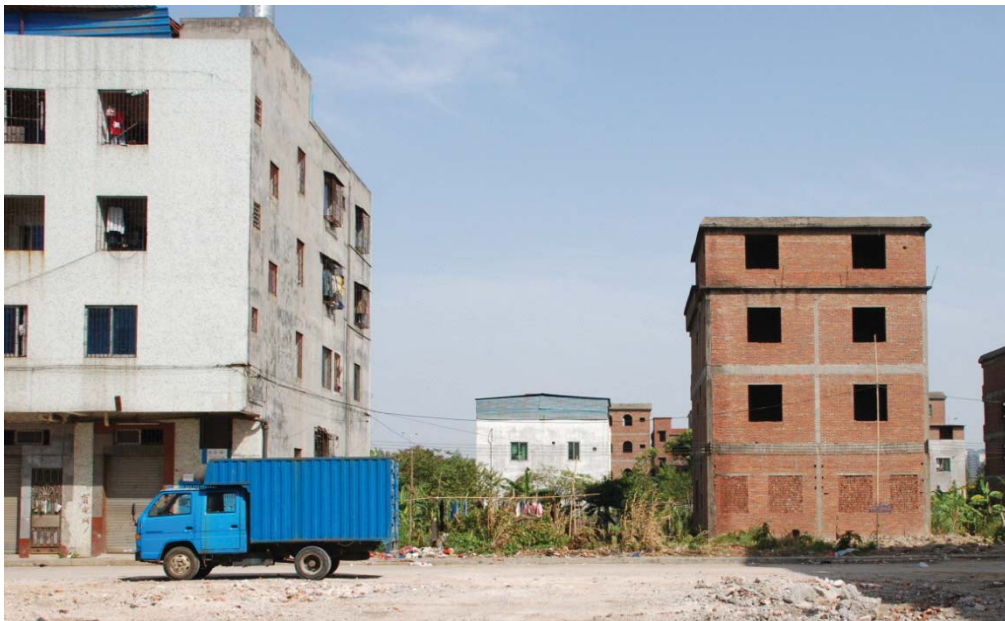
FIGURE 1: Jian Sha Zhou in 2008, half-completed buildings on the Danwei site.

This built fabric was different from the village typology found in southern China, comprised of dense clusters of village houses surrounded by fields and planting areas. The visual evidence seemed to support that construction had been curtailed by the financial crisis and that migrant workers had returned home.