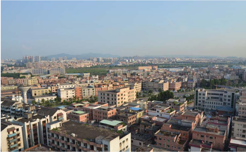
FIGURE 4: Jian Sha Zhou's emerging urban fabric.