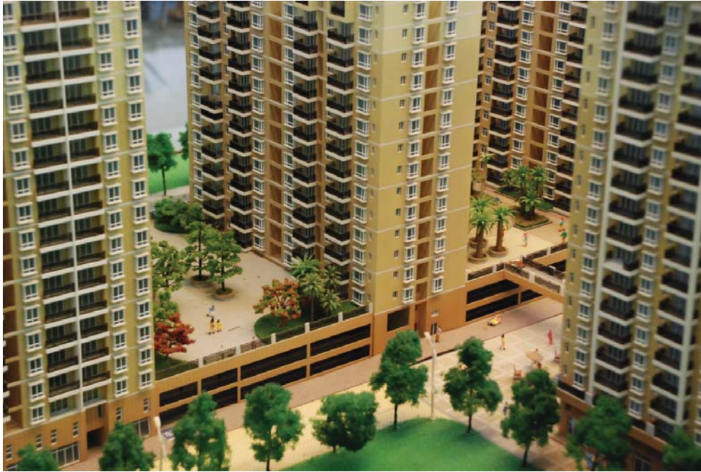
FIGURE 10: The rampant construction of residential towers in Dongguan as part of China's overheated housing bubble.

succumbed to the city both in name and in character. However, this shift has its disadvantages and may lead to further disagreements.