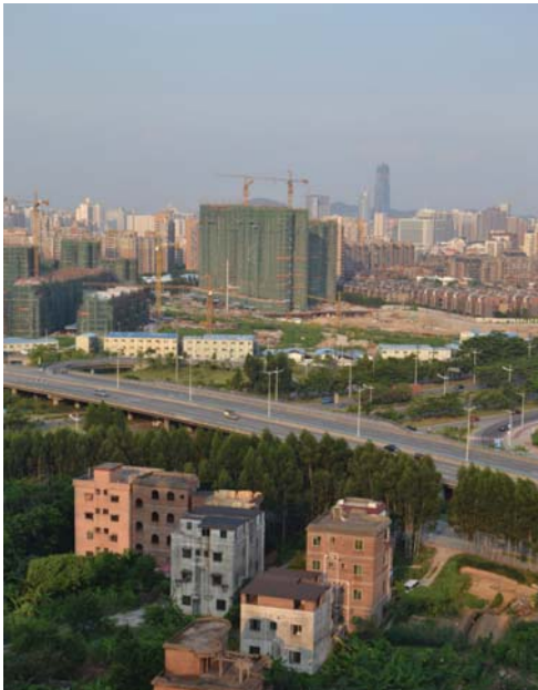
FIGURE 8: Jian Sha Zhou, a new shequ.

The new residential towers were built as a collaborative venture between the vil-