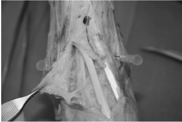
Figure 4 Using the medial border of the tibialis anterior tendon as reference point in measurement is subject to variations in ankle positions, especially after dissection of fascia for identification of the anterior tibial artery and deep peroneal nerve.

0.5–13.1 mm), and (2) the AL portal to the intermediate dorsal cutaneous branch of the superficial peroneal nerve (mean, 5.5; range, 0.4–14.4 mm) were short, and thus may be an anatomic hazard. To avoid inadvertent injury to nearby neurovascular structures, (1) the AM portal should be placed >13 mm lateral to the standard portal at the AM corner of the talocrural joint; (2) the AL portal should be placed as close to the fibula as possible, and a straight haemostat should be used to snipe and spread prior to trocar insertion to avoid neuropraxia or vessel injury even if the nerves are in