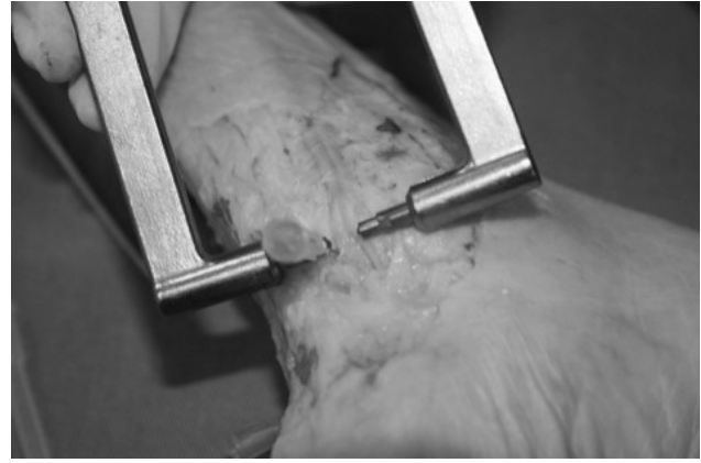
Figure 2 An analogue thickness gauge with ball tips measurable to 0.05 mm is used for distances <15 mm.

The success of surgery mainly depends on safe establishment of arthroscopic portals in relation to adjacent neurovascular structures, and thus avoid inadvertent injury. 1 We investigated anatomic variations of neurovascular structures of the ankle and the safety margin for arthroscopic portals.