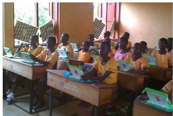
Photo 4. Students contributing their technical expertise to build the new world

people of diverse cultures. As a result, a vision of performing social responsibilities as a member of the global community can be developed and the fourth educational aim: Intercultural understanding and global citizenship, can be developed. In addition, through this project, students can participate actively in promoting the local and global social, economic and environmental sustainability, so that they can learn leadership skills and advocate for the improvement of the human condition in Africa. Hence, the sixth educational aim can be achieved.