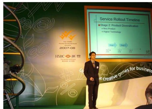
Photo 1. An electrical engineering student was trained in front of camera and HSBC CEO to present their technological entrepreneurial idea

contests exclusively tailored for business students only. In order to equip engineering students with practical business senses and entrepreneurial sprits, the HKU EEE Department encouraged and supervised a team of Electrical Engineering students to participate in the HSBC Young Entrepreneur Award [2]. The team applied their engineering knowledge to develop a new entrepreneurial business on “Green Roof Engineering” and won the Silver Award, which was the first time that engineering students won such award in their history. This learning activity can align with the first educational aim which sustains students’ intellectual curiosity and enthusiasm for learning and helps students to pursuit of professional excellence and encourage critical intellectual enquiry. It can also foster students to work with others and make constructive contributions, strengthen their communication and collaboration skills which achieve the fifth aim.